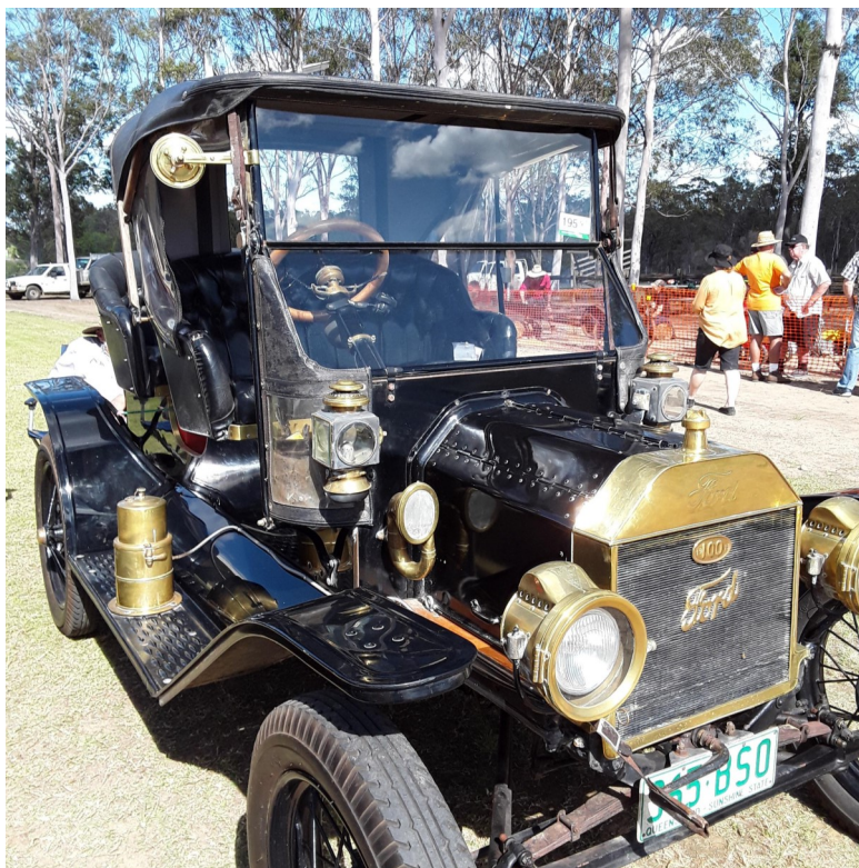
Arguably the best vintage car on display