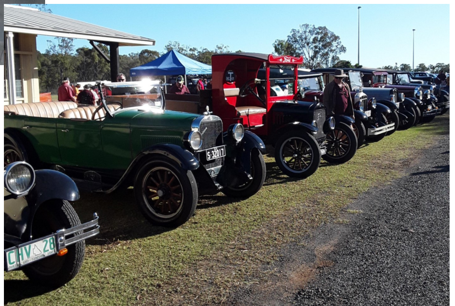
Vintage cars on display