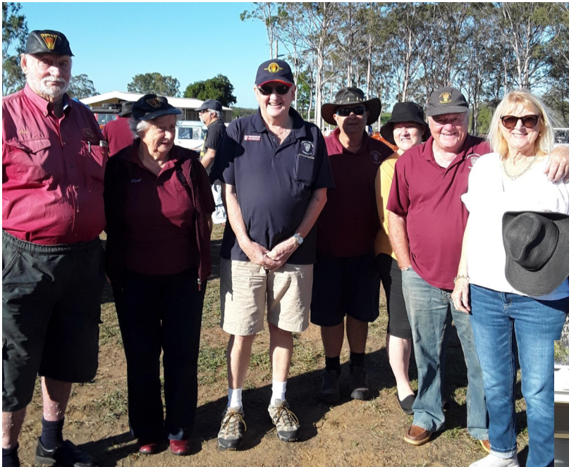
Enjoying the Bundaberg sunshine